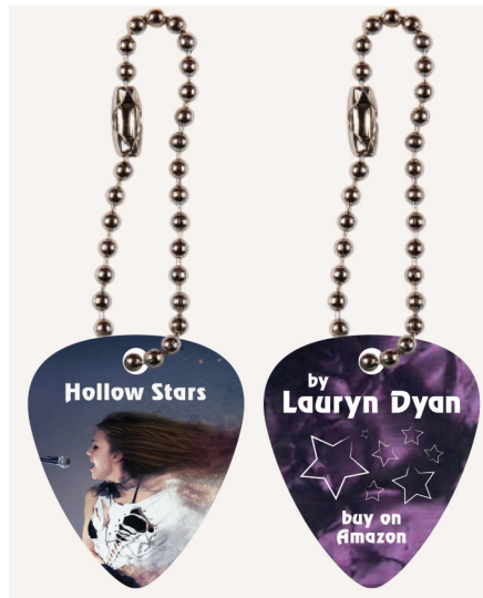
Promotional Guitar Picks