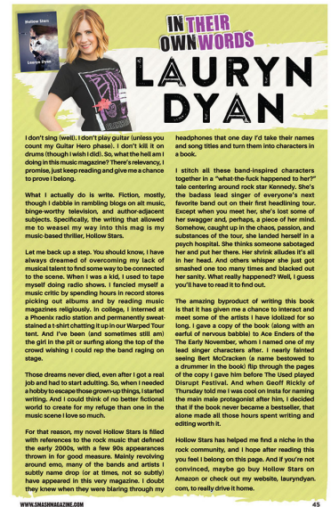
Smash Magazine Feature