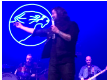
Taking Back Sunday