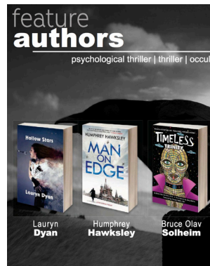
Uncaged Book Reviews