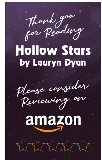
Bookmarks for Paperbacks