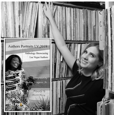
Vegas Author Anthology